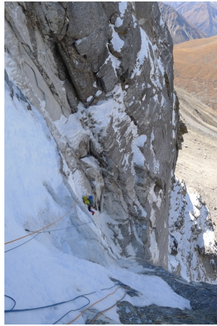
Unclimbed S. Ridge of Kojichuwa Chuli. Rocky peak is unclimbed forepeak.