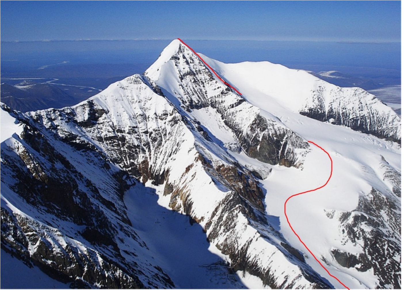
Mount Skarland South East Ridge and Ski Descent (from 9200ft)