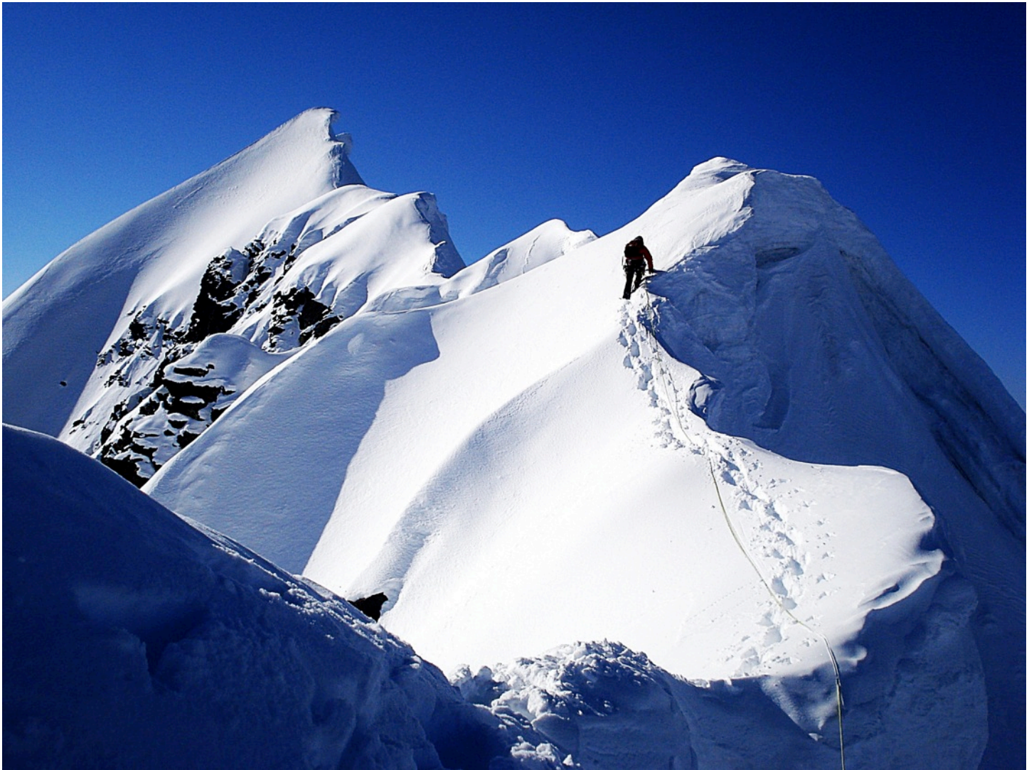
Mt Geist Summit Traverse (1/3 rd into traverse) Summit cornice at very back of photo