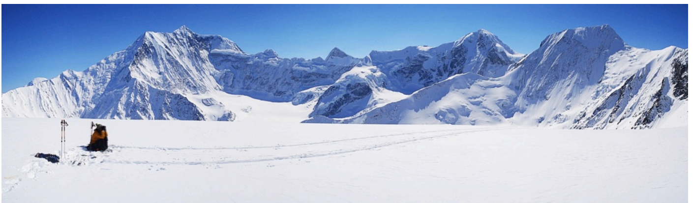
Panorama from foot of Skarland SE Ridge. From left to right: Mount Hayes, Pt 10910, Balchen, Geist