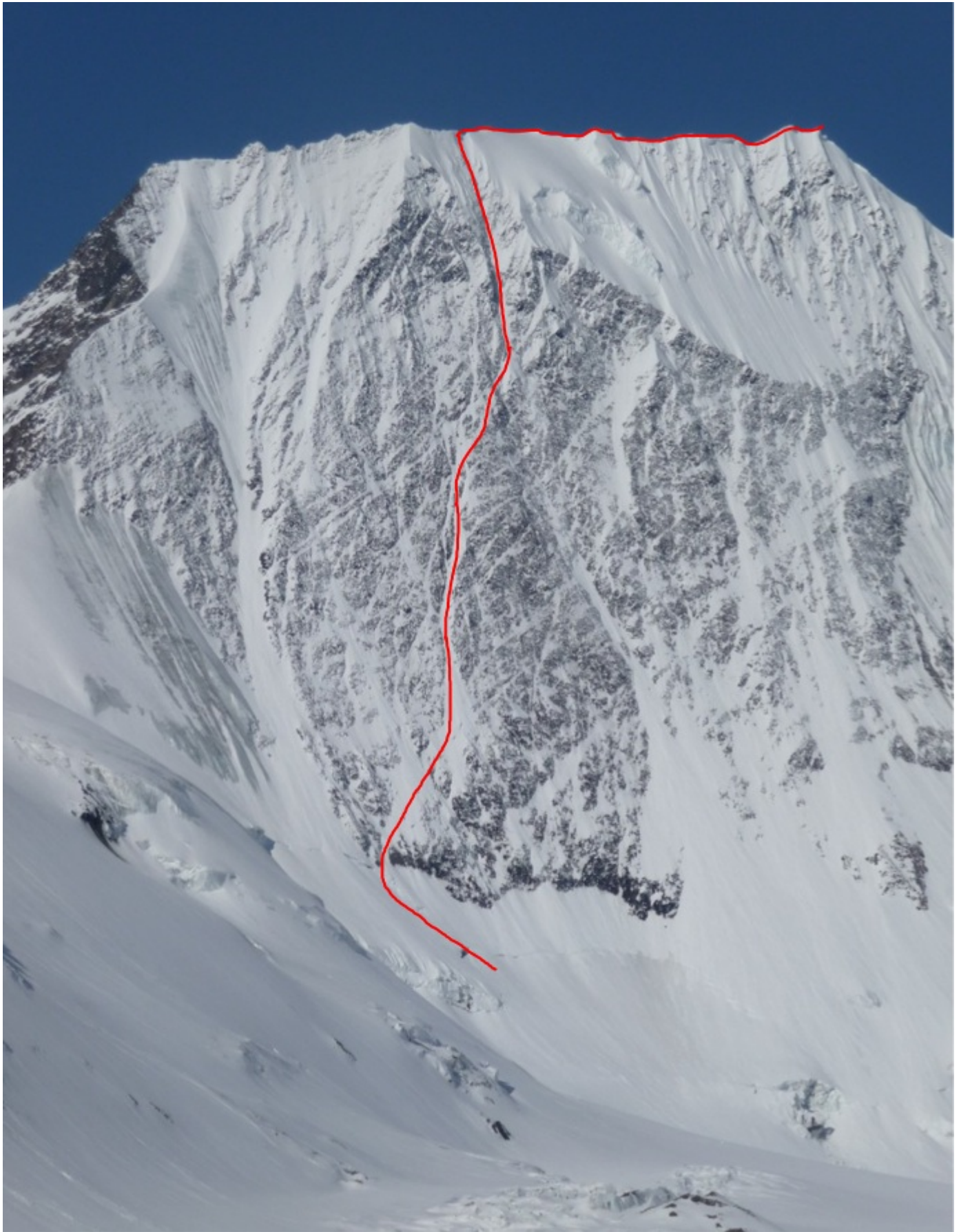
Mount Geist NE Face Direct 1000m-1200m plus Summit traverse