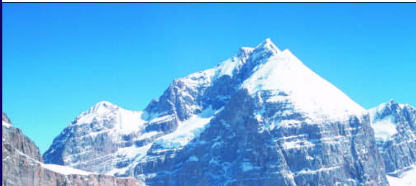
Pik Koroleva (5816m) from SW. The mountain has had only one ascent, probably by the hanging glacier from the left side of the face. The NE side is even more impressive, particularly the sustained-looking E Rib.